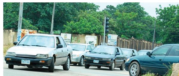
Figure 2. View of vehicular congestion releasing pollutants in Jalingo metropolis