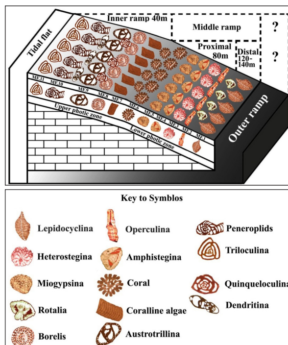
Figure 5. Depositional model for the carbonate platform of the Azkand Formation.

The distribution of larger benthic foraminiferal assemblages are excellent indicators used as valuable tools to reconstruct palaeoenvironmental models in warm, shallow marine environments, especially in monotonous carbonate platform successions (Geel, 2000). In this study, two main environmental gradients can be identified in the Azkand formation. These include inner-ramp and middle-ramp environments. A general depositional scheme is provided in (Figure 5).