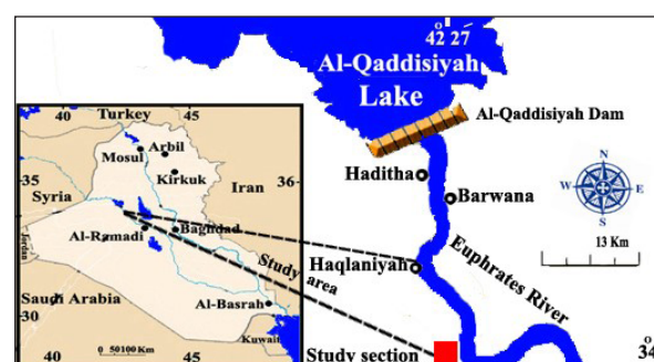
Figure 1. Location map of the study area.

This study is based on one outcrop section measured and sampled in the area located ten kilometers to the south of Hadetha Town, at the right bank of the Euphrates river Figure (1). A total of seventeen samples were collected and studied, more than thirty-five thin-sections were prepared and examined in the laboratory. In addition, two samples were taken directly above the boundary from the basal conglomerates for comparison, and the outcrops were sampled at one- meter intervals (Figure 2).